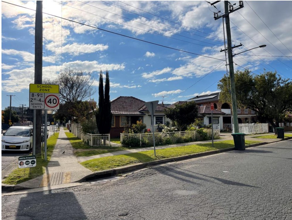
Fig 2: View of the subject site, looking north-east from the Chelmsford Avenue/Northam Avenue intersection