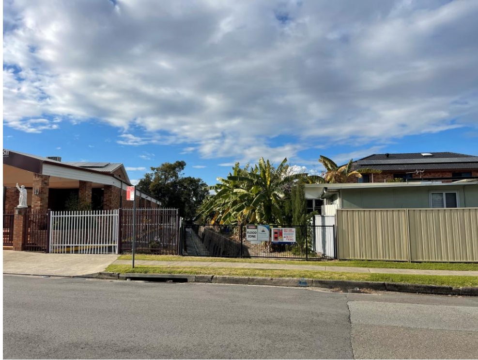
Fig 6: View of the subject premises, looking east along the rear, Salt Pan Creek boundary