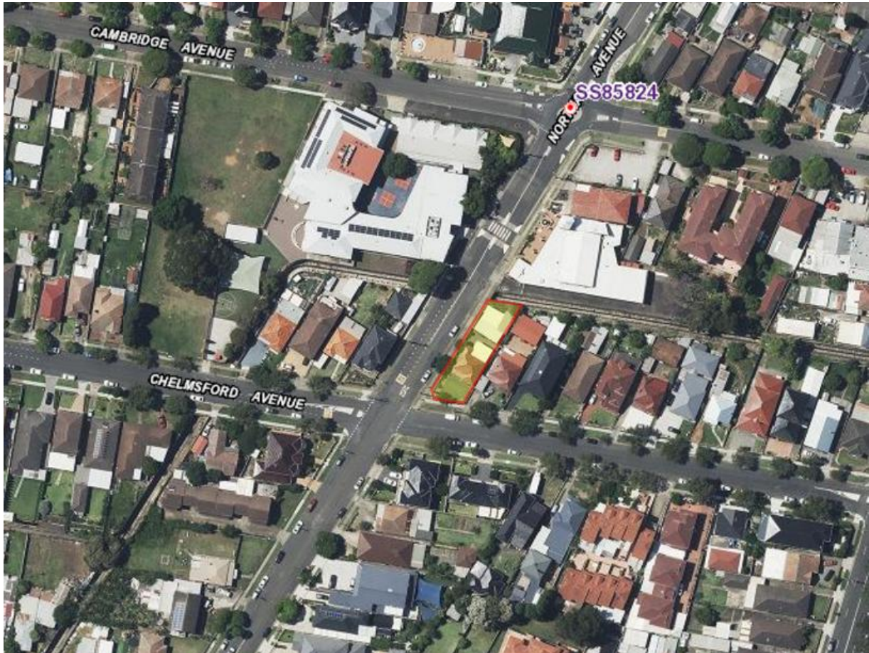
Fig 10: Aerial photograph of subject site

The site and surrounds are characterised by the residential nature of the locality. Within close proximity to the site is St Brendan's Catholic Primary School and Catholic Church. Grahame Thomas oval and Bankstown oval are also located nearby, as well as Bankstown City Gardens.