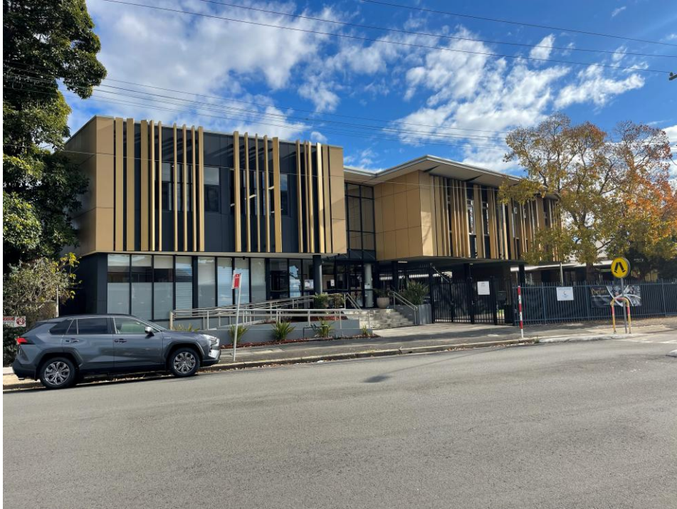
Fig 8: View of St Brendan's Catholic Primary School, located to the north-west of the subject premises