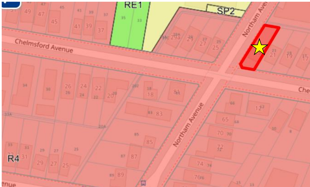
Fig 11: Extract of Bankstown Local Environmental Plan 2015 – Zoning Map

The subject site is zoned R4 High Density Residential under the Bankstown LEP 2023. The proposal seeks to provide for the demolition of an existing dwelling and construction of a new low scale single residential dwelling house and associated landscaping.