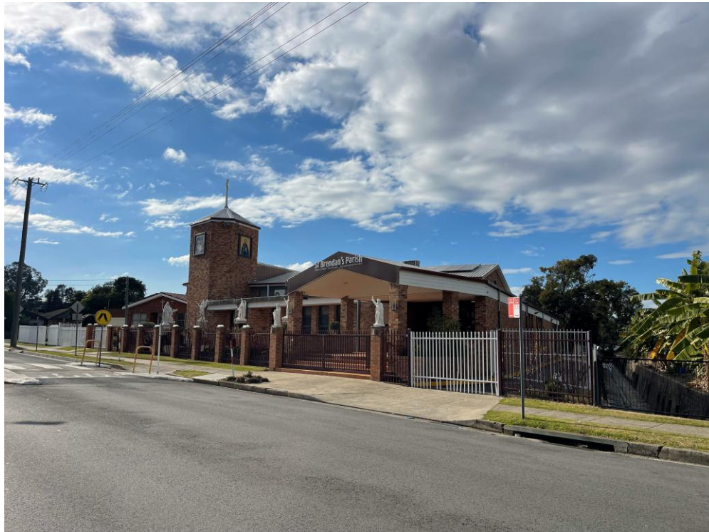
Fig 7: View of St Brendan's Catholic Church, located to the north-east of the subject premises