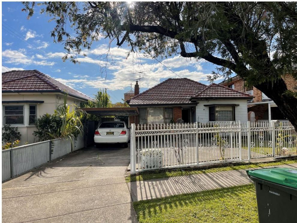
Fig 3: View of the neighbouring dwelling to the east at No 21 Chelmsford Avenue