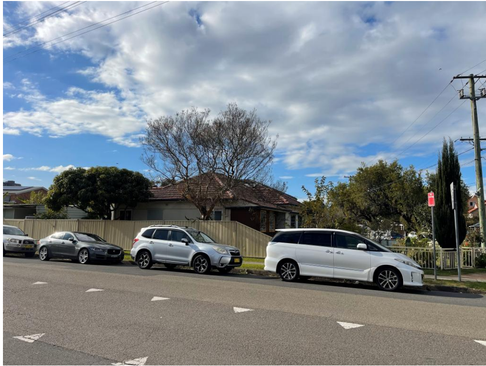
Fig 4: View of the subject premises, looking east from Northam Avenue