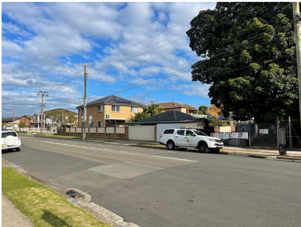
Fig 9: View of the existing development opposite the site on the western side of the intersection of Chelmsford Avenue & Northam Avenue, looking south-west