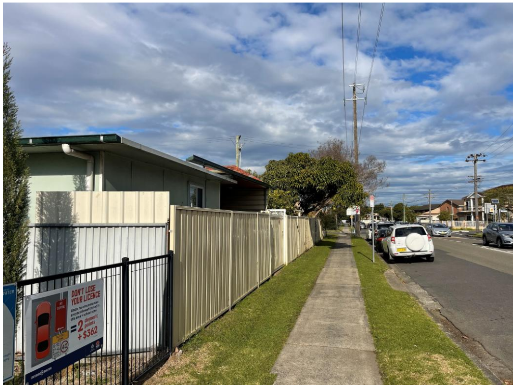
Fig 5: View of the subject premises, looking south-west along the Northam Avenue frontage